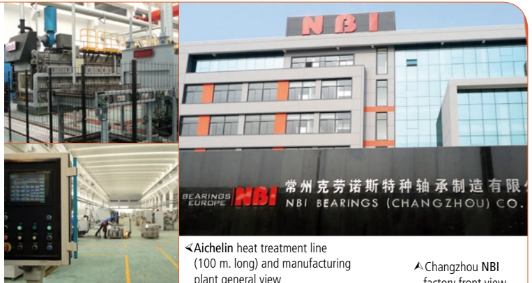
◀ Aichelin heat treatment line (100 m. long) and manufacturing plant general view

This new building, occupying over 25,000 m 2 , houses the manufacturing and production area as well as our Asia office and administration.